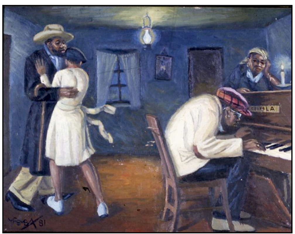
FIGURE 1a: George Pemba, Kwa Stemele , oil on cardboard, 1981.