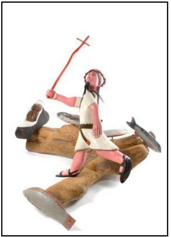
FIGURE 4a: Johannes Maswanganyi, Jesus is Walking on the Water, wood, paint, barbed wire, animal hair, 1994.