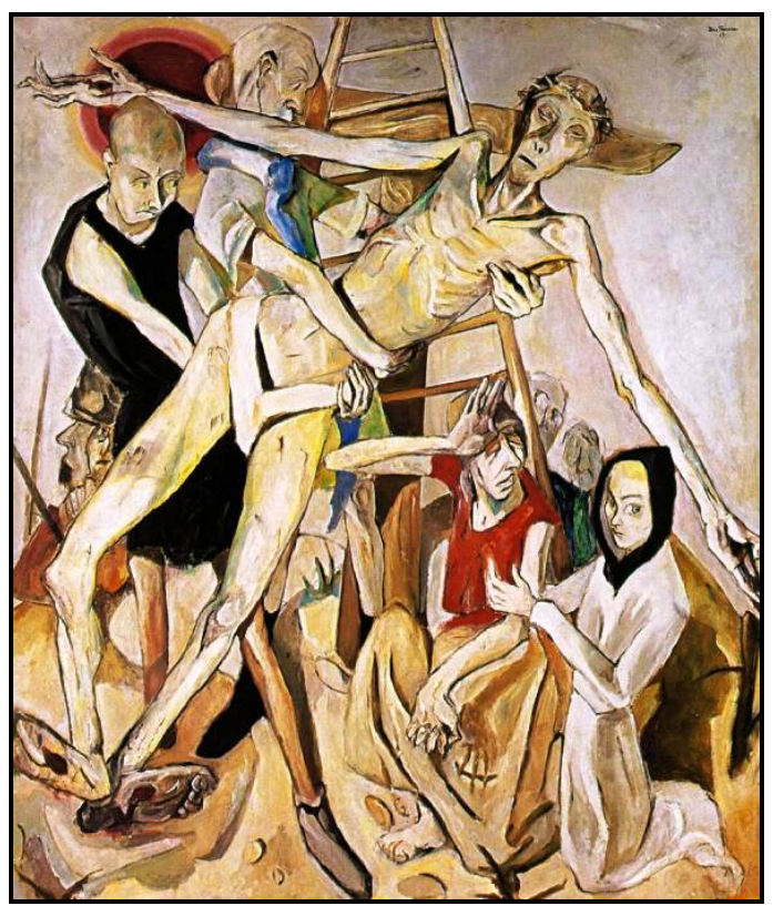
FIGURE 4b: Max Beckmann, Descent from the Cross , oil on canvas, 1917.

FIGURE 4a: Johannes Maswanganyi, Jesus is Walking on the Water, wood, paint, barbed wire, animal hair, 1994.