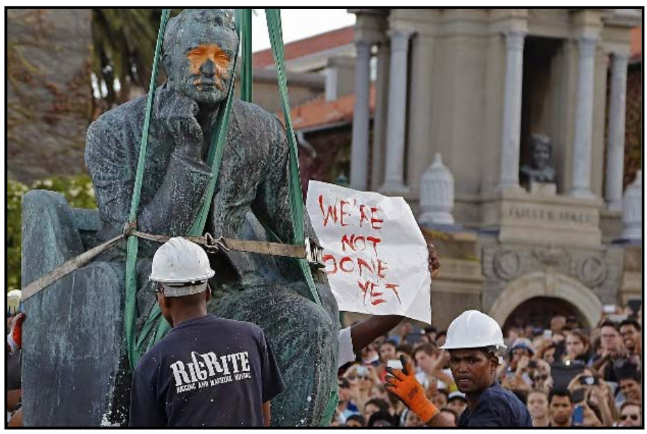
FIGURE 8b: The removal of the Cecil John Rhodes statue, University of Cape Town, 2015.