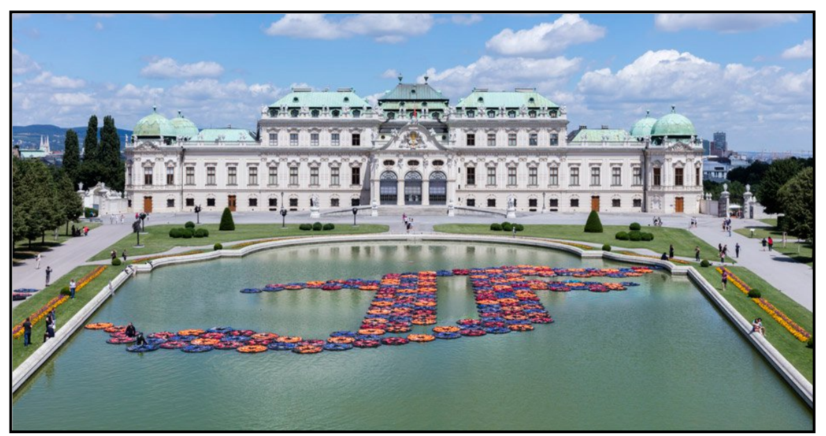
FIGURE 5a: Ai Weiwei, F Lotus , installation, Belvedere Museum, Vienna, Austria, 2016.