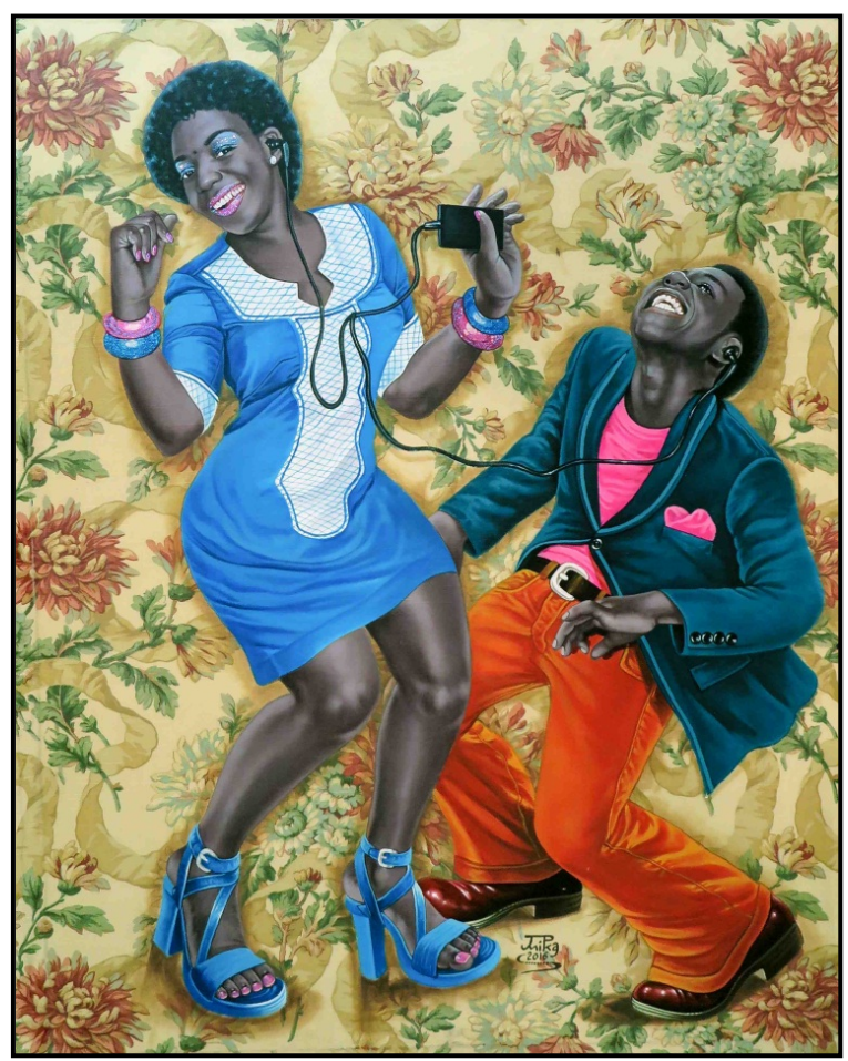
FIGURE 1b: JP Mika, La Belle ambience , acrylic on fabric, 2016.