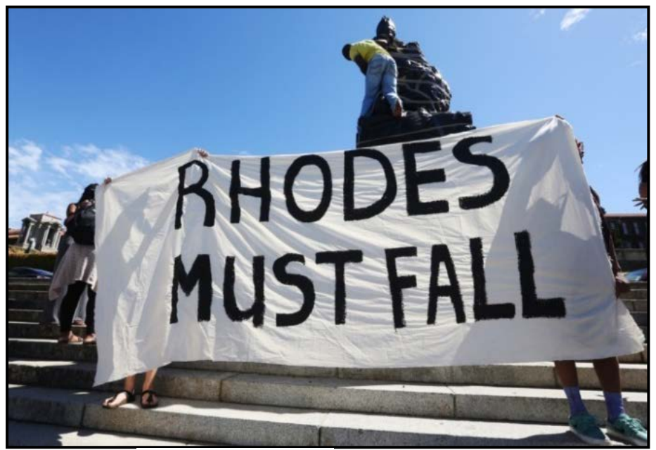
FIGURE 8a: Photograph of the Cecil John Rhodes statue , made from bronze and erected in 1934, being removed from the campus of the University of Cape Town.