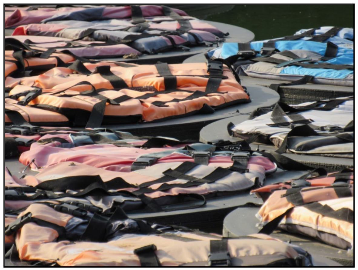
FIGURE 5b: Ai Weiwei, F Lotus , installation, Belvedere Museum, Vienna, Austria, 2016. (Close-up of 1 005 worn life jackets into the shape of lotus flowers in the pond.)