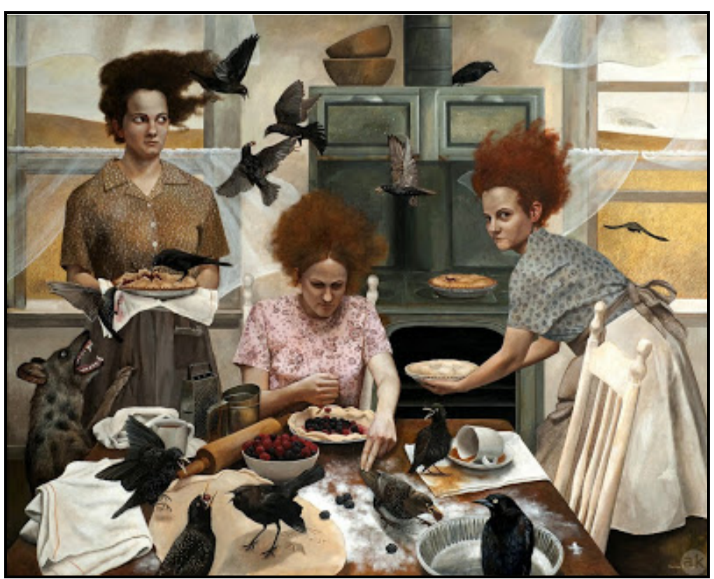
FIGURE 7a: Andrea Kowch, The Visitors, acrylic on canvas, 2010.