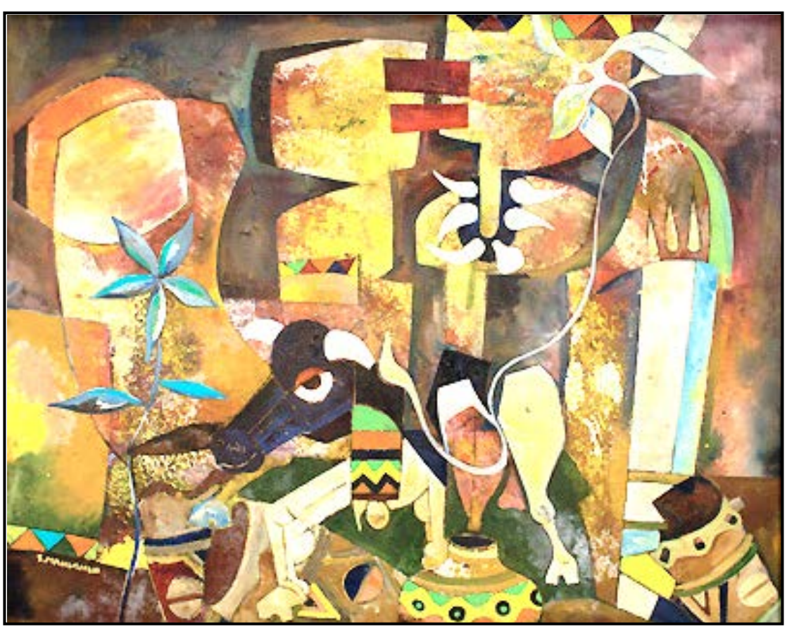
FIGURE 2a: Speelman Mahlangu, Ubuntu Spirit of African Solidarity , oil on canvas, date unknown.