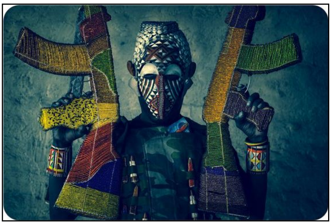
FIGURE 2b: Ralph Ziman, Hondo 'War' (Shona) MUTI Gallery, digital print on Moab Entrada paper, 2013.