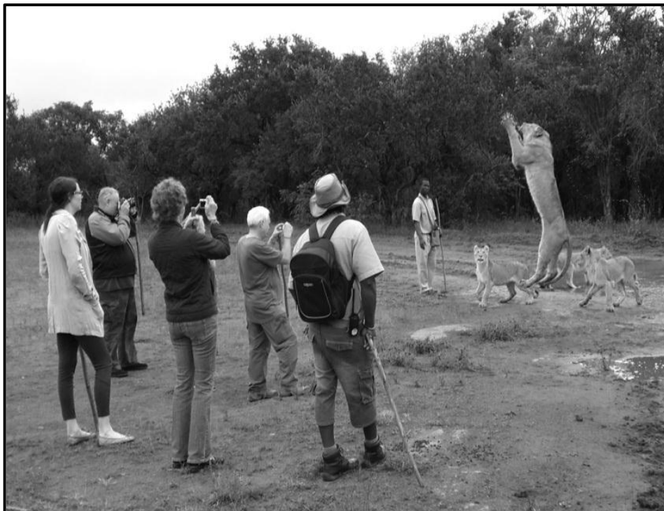
[Sicashunwe ku- www.googlepics.com ]