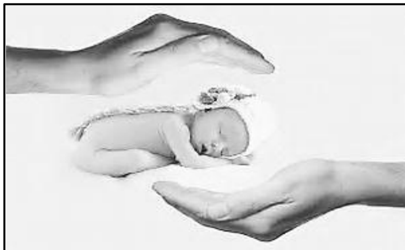
[Setshwantsho se qotsitse inthaneteng]