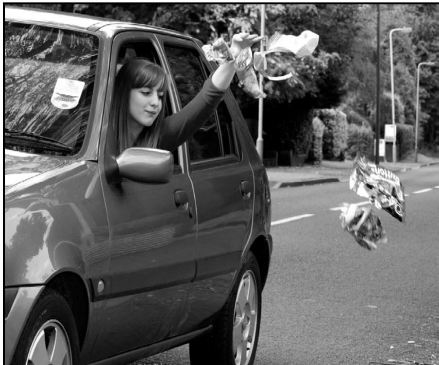
[Tshi bva kha Inthanethe]