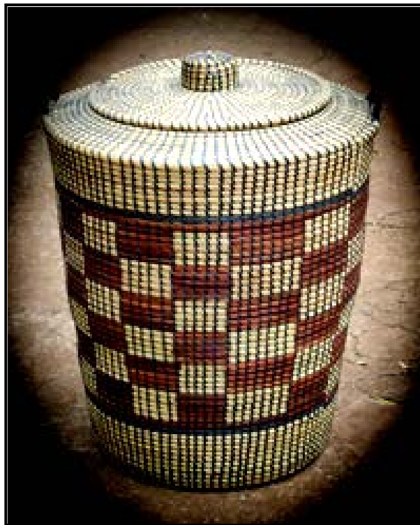
FIGURE B: Zulu Basket by RootzCreationz (South Africa), 2013.