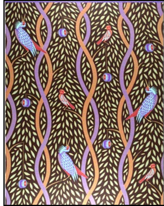
FIGURE B: Vlisco textile by Vlisco Fabrics (Democratic Republic of the Congo), 2007.

Compare the two textile designs above, using the following as guidelines: