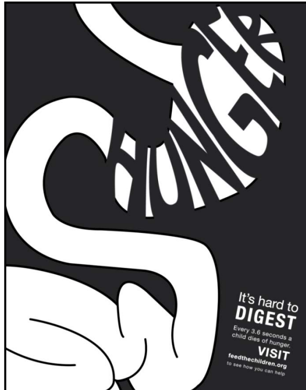
FIGURE A: Poster promoting awareness of worldwide child hunger by Karen Morvan (USA), date unknown.