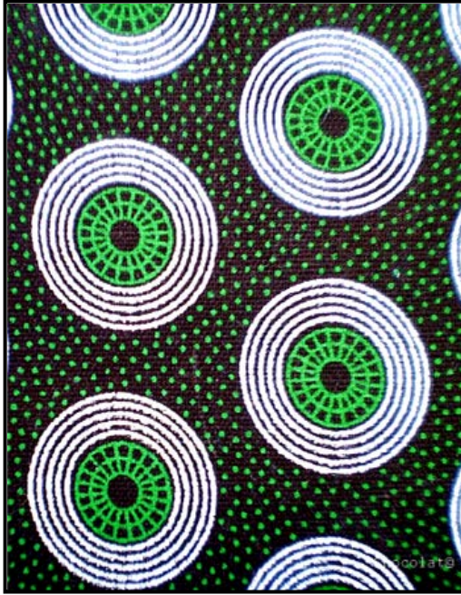
FIGURE A: Shweshwe textile by Da Gama Textiles (South Africa), 2009.