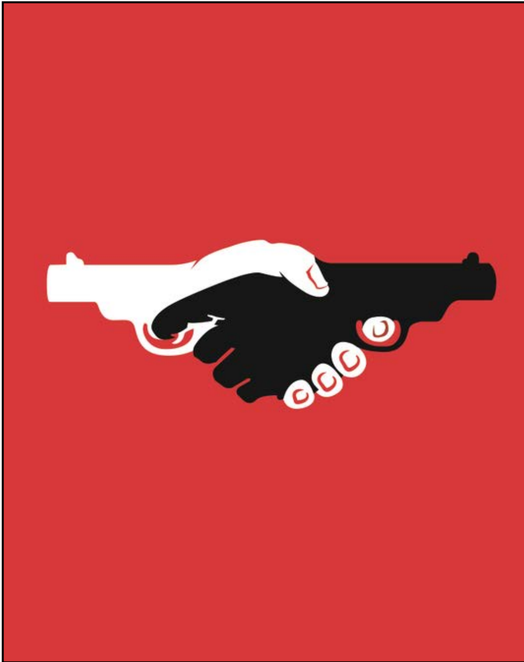
FIGURE A: 15 th Anti-Racism Festival Poster by Unusual (USA), 2005.