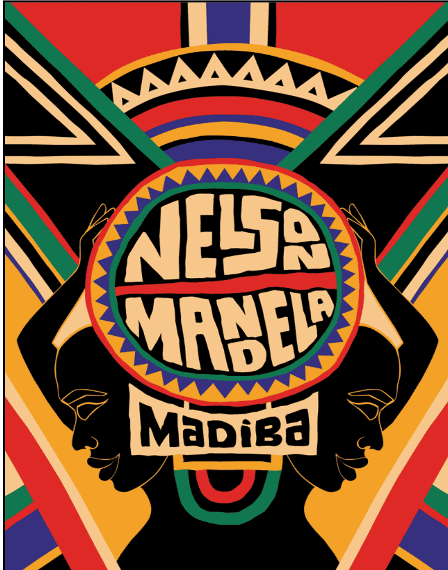
FIGURE A: Admirable Man from the 95 Nelson Mandela poster collection by Ana Paula Caldas (South Africa), 2013.

Analyse the use of the following elements and principles of design in relation to FIGURE A above: