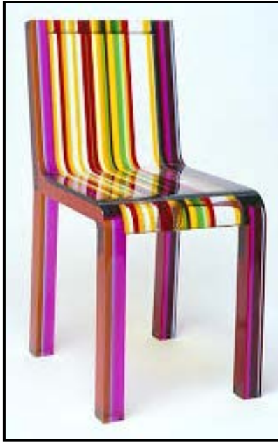
FIGURE A: Rainbow Chair by Patrick Norguet (origin and date unknown). (Pop Art)