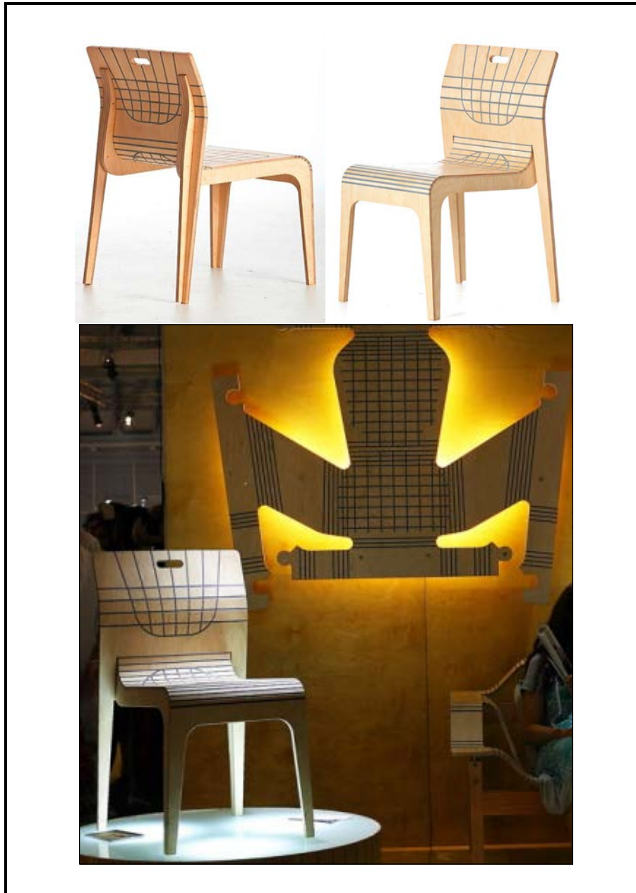
FIGURE B: Flexible Flat-pack Chairs by Wintec's Stratflex line (South Africa), 2013.

1.2.1 Analyse and discuss the use of the following design terms in relation to FIGURE B above: