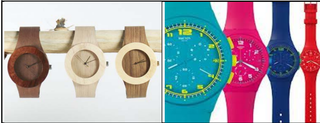
FIGURE A: Co.'s Carpenter line of watches , made from recycled wood.