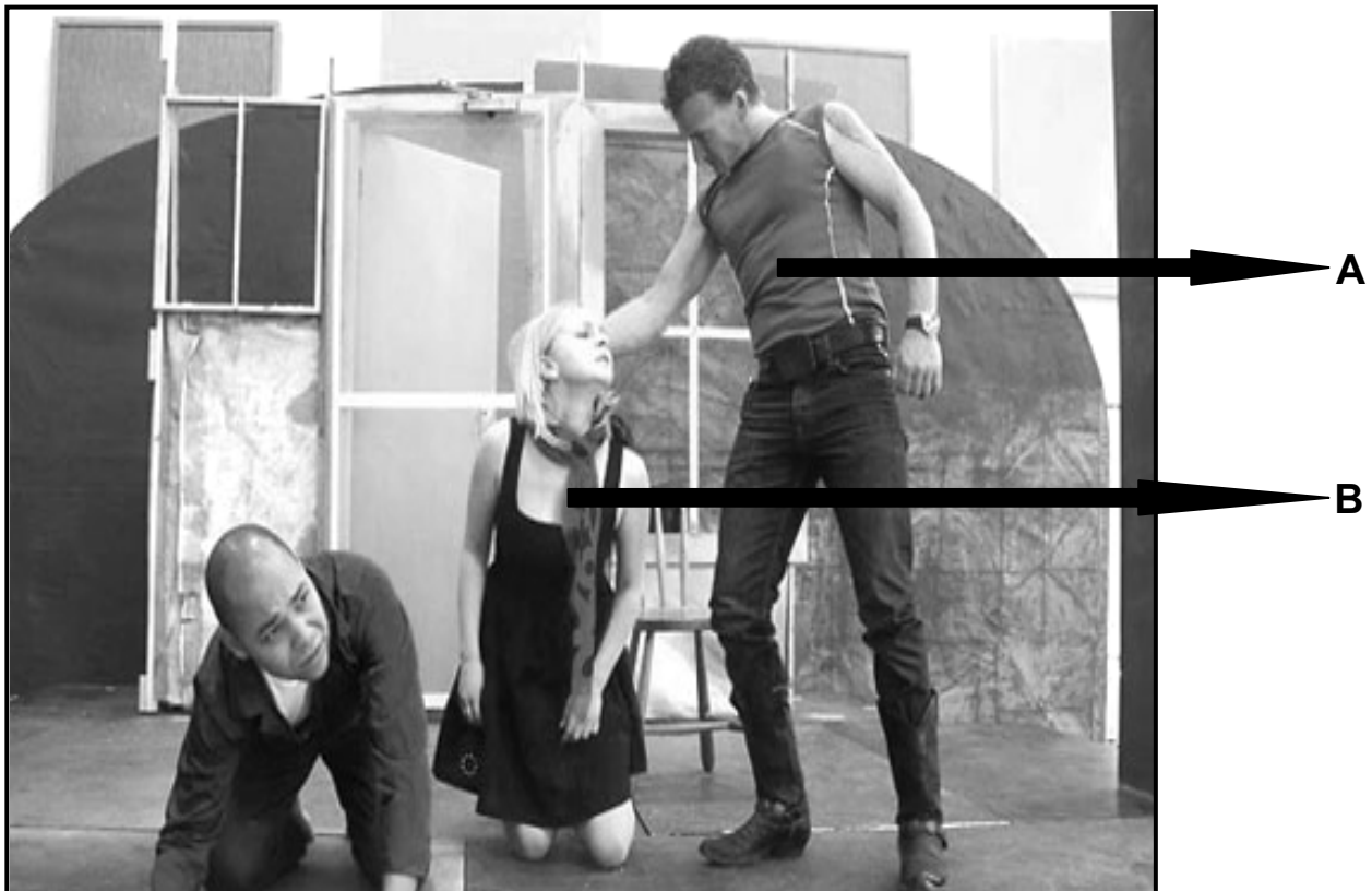
A scene from a production of Siener in die Suburbs

Study the sources below and answer the questions that follow.