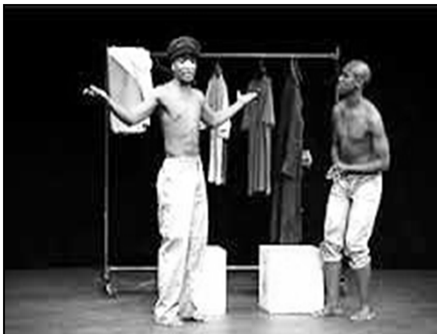
A scene from a production of Woza Albert!

Study SOURCE A below and answer the questions that follow.