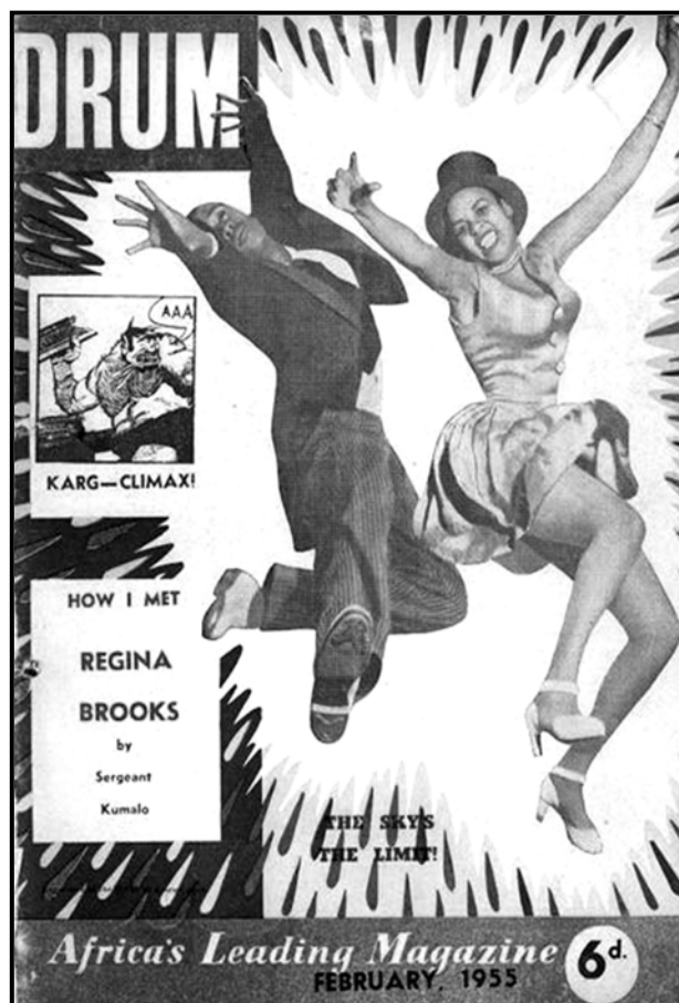
A cover of Drum magazine