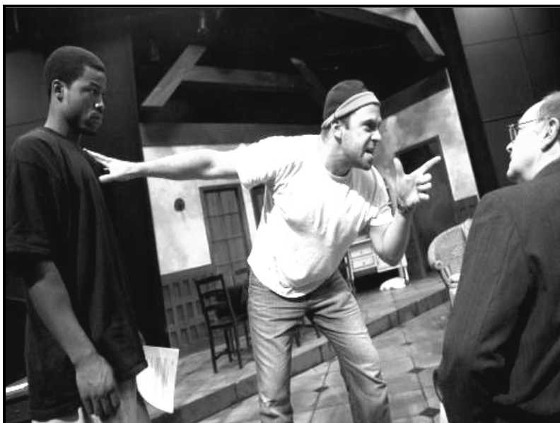
A scene from a production of Groundswell

Study the sources below and answer the questions that follow.