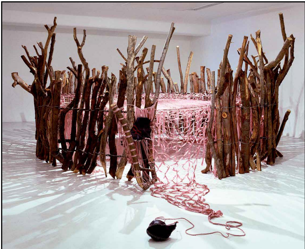
FIGURE 2b: Nicholas Hlobo, Umthubi , exotic and indigenous wood, steel, wire, ribbon and rubber inner tube, 2006.