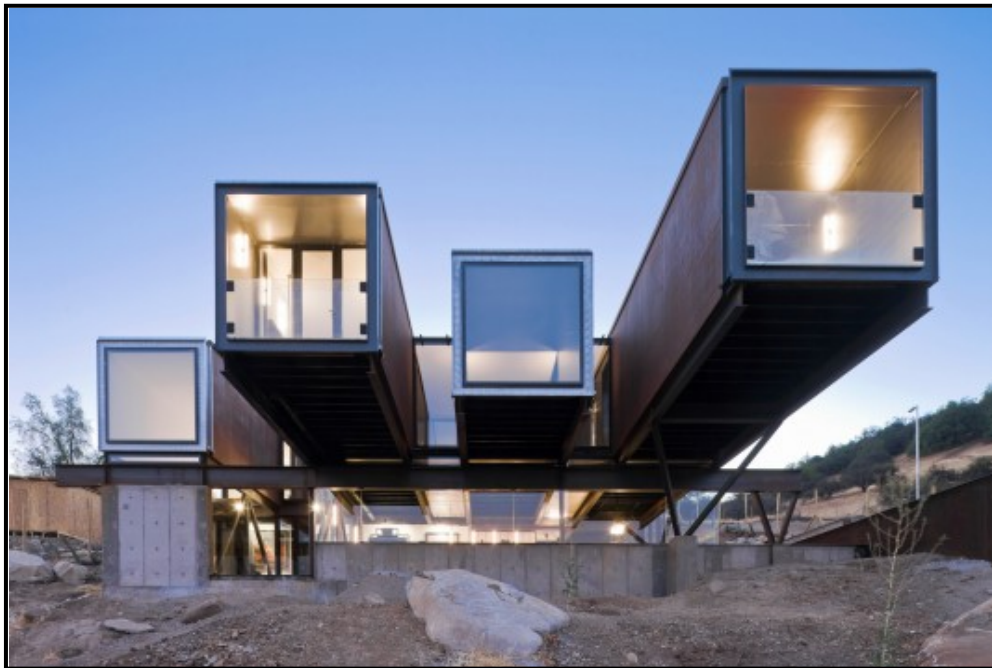
FIGURE 8a: Sebastián Irarrázaval, Caterpillar House , a shipping container-based family residence overlooking the Andes Mountain, Chile. The house comprises 12 shipping containers which provide bedrooms, living quarters and a swimming pool, 2012.