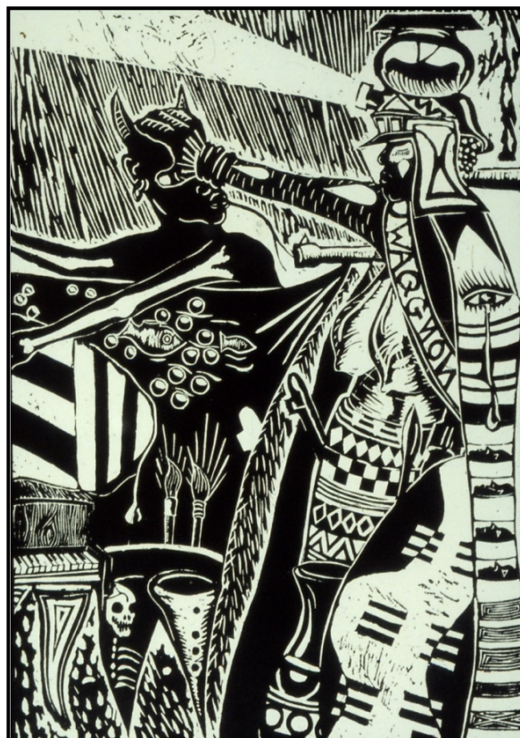
FIGURE 4b: Billy Mandindi, Prophecy III , lino relief-print, 1985.