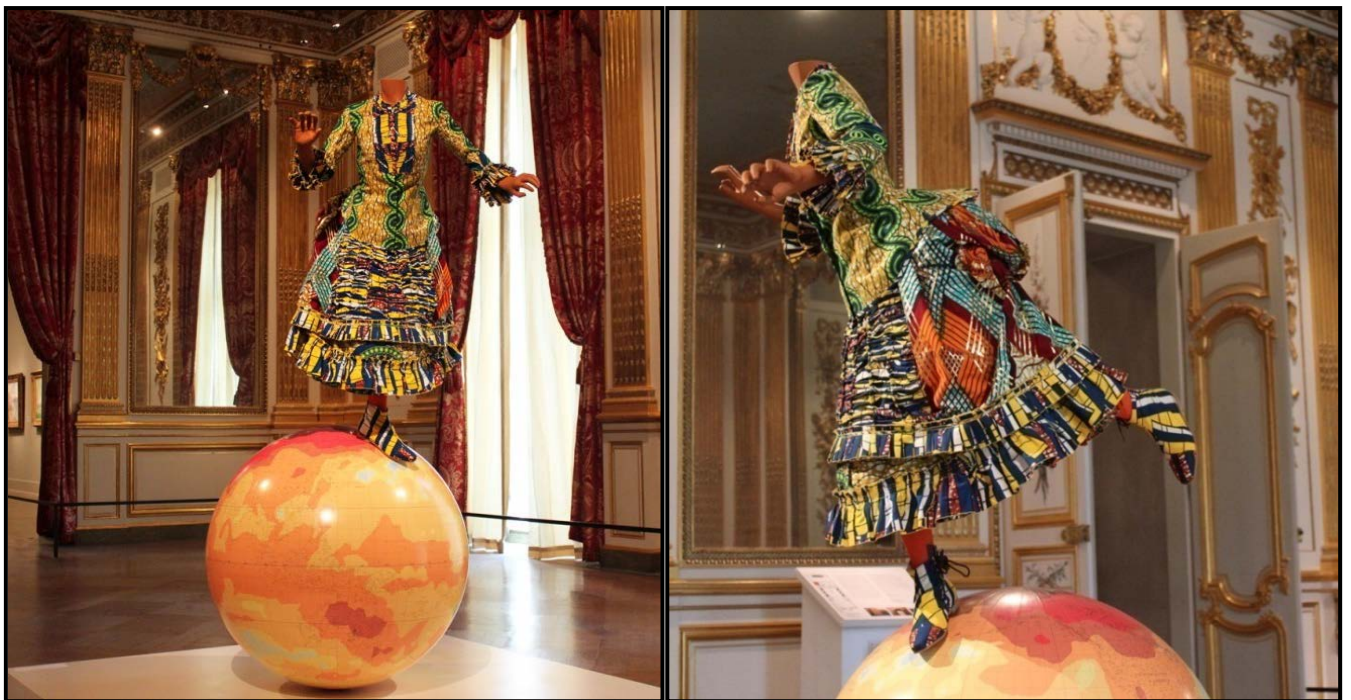
FIGURE 5b: Yinka Shonibare, Girl on Globe 2 , site-specific installation: fibre-glass mannequin, Dutch wax-printed cotton, globe, 2011.