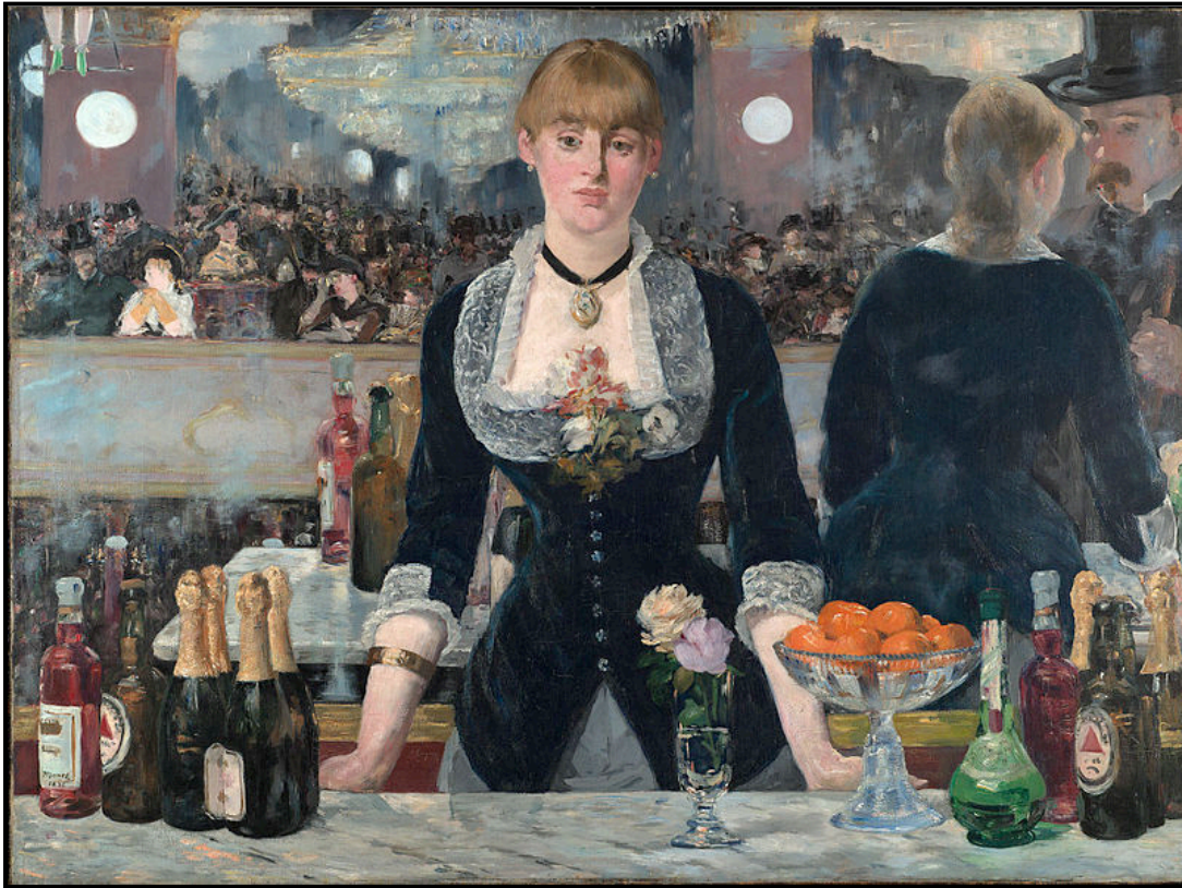
FIGURE 7a: Édouard Manet, Bar at the Folies-Bergère , oil on canvas, 1882.