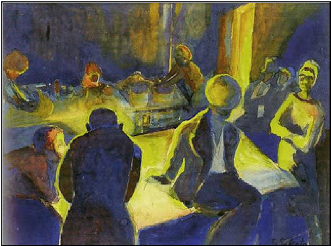
FIGURE 1a: Gerard Sekoto, The Shebeen , Sophiatown, gouache, circa 1939.