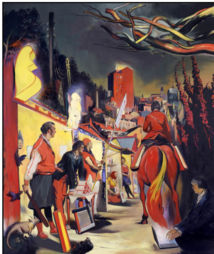
FIGURE 6b: Neo Rauch, Abendmesse (Evening Fair) , oil on canvas, 2012.