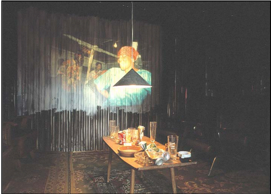
FIGURE 1b: Kay Hassan, The Shebeen , site-specific installation including a projected image on corrugated iron, with background sound from everyday life, 1997.