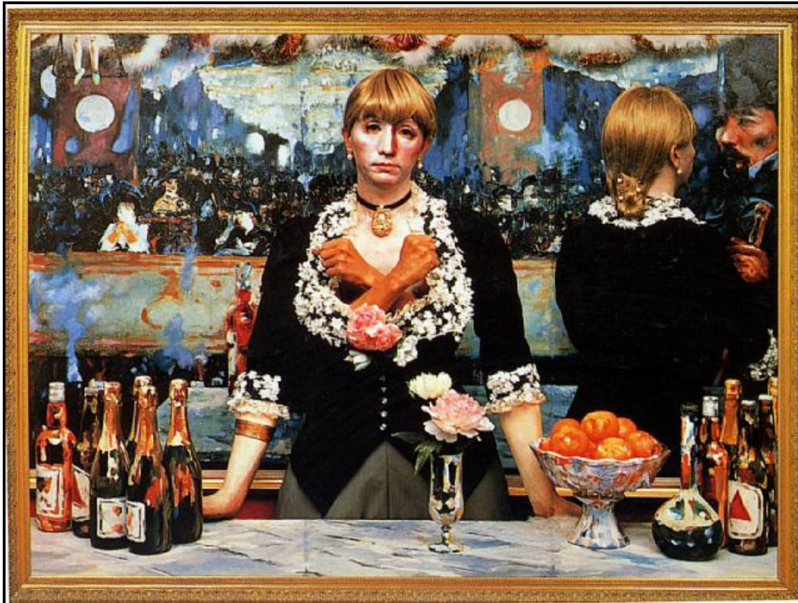
FIGURE 7b: Yasumasa Morimura, Theater A , pixilated photograph, colour photo printing, 1990. The artist creates scenes from famous paintings and inserts himself as the central/main character.