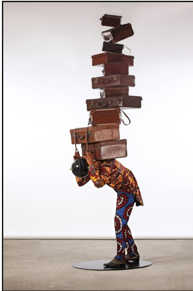
FIGURE 5a: Yinka Shonibare, Homeless Man , mannequin, Dutch wax-printed cotton textile, leather suitcases, globe and metal base, 2012.