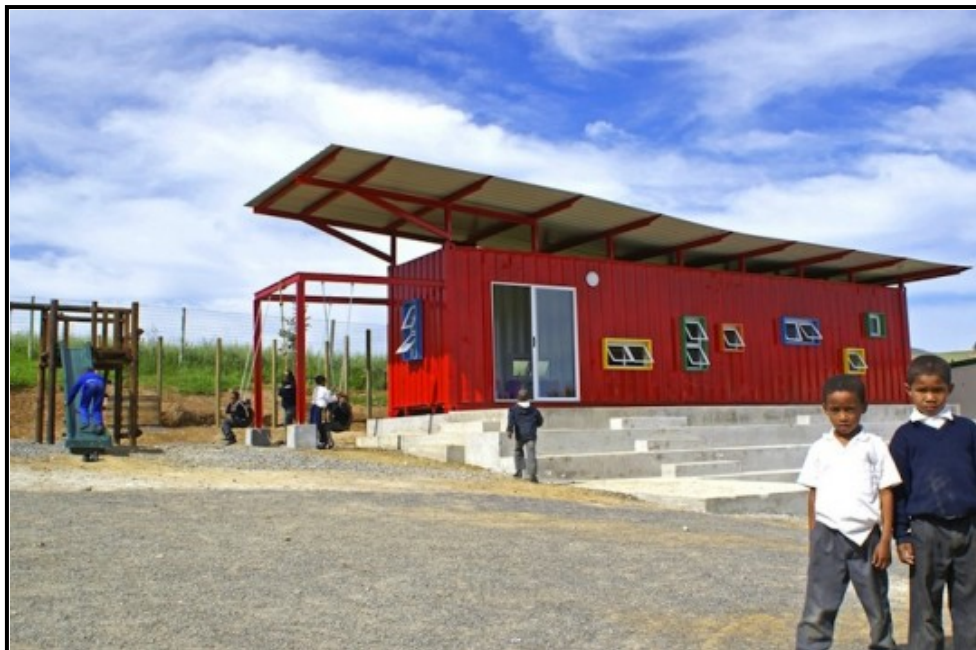
FIGURE 8b: Tsai Design, initially conceptualised by 15-year-old Marshaam Brink, Vissershok Container Classroom project , Du Noon township, South Africa, recycled containers, concrete, glass and polystyrene, 2012.