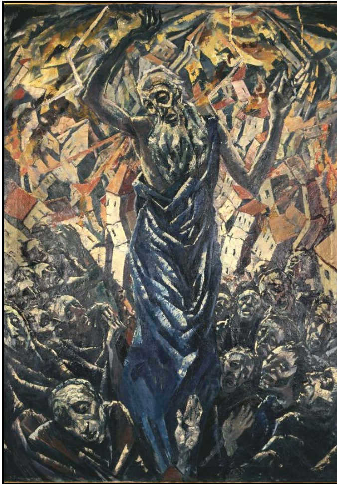
FIGURE 4a: Jakob Steinhardt, The Prophet , oil on canvas, 1913.