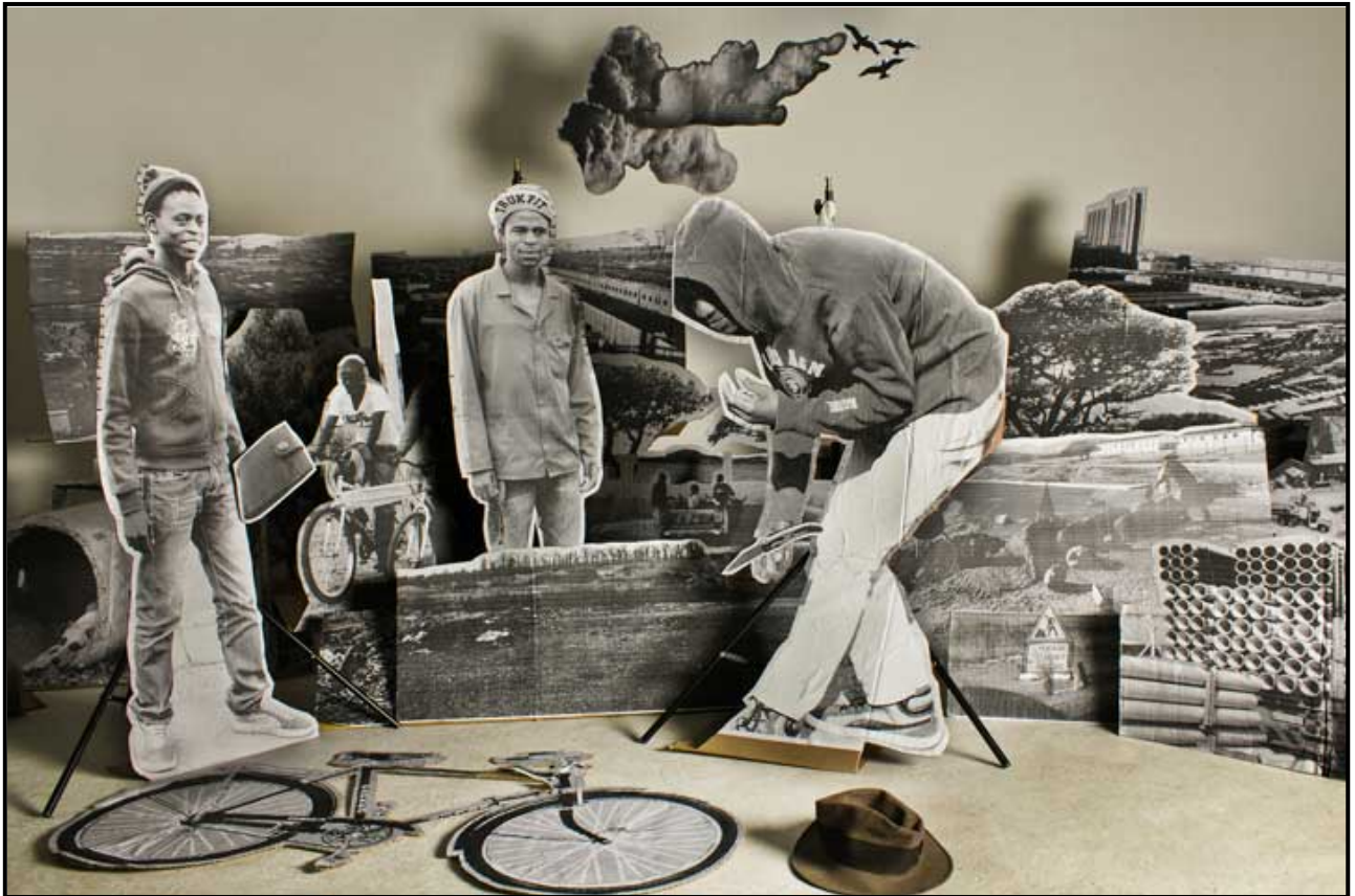
FIGURE 6a: Lebogang Kganye, The Bicycle , digitally manipulated photograph of life-sized cardboard cut-outs of enlarged photos, 2013.