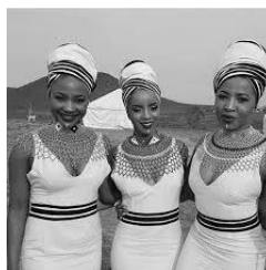
Iqhiya or headscarf or 'doek'

The iqhiya or headscarf was traditionally worn by married women and to complete the outfit, embroidered capes or blankets were worn around the shoulders. The scarf is supposed to conceal the female figure as well as safeguard her fertility, while the 'doek' is a sign of respect towards the elders; a new bride cannot talk to the elders bare-headed.☑