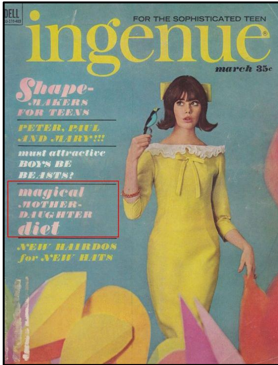
FIGURE D: Ingenue Magazine Cover by Dell Publishing Company (London), 1964.