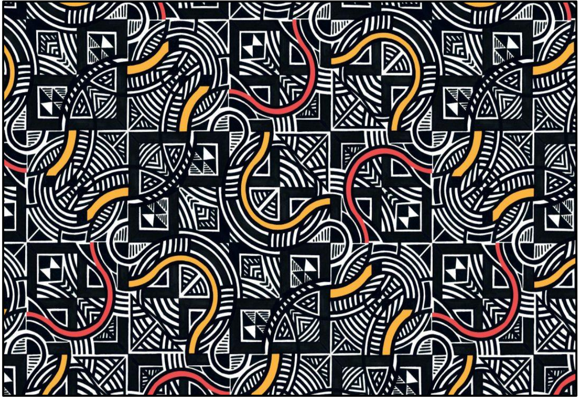
FIGURE B: Award-winning Pattern Design by Agrippa Mncedisi Hlophe (South Africa), 2019.

1.2.1 Analyse the use of the following elements and principles in FIGURE B above: