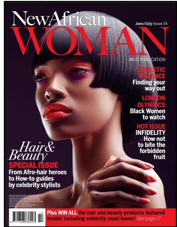
FIGURE E: New African Women Magazine Cover by IC Publications (London), 2014.

Compare the magazine cover in FIGURE D with the magazine cover in FIGURE E.