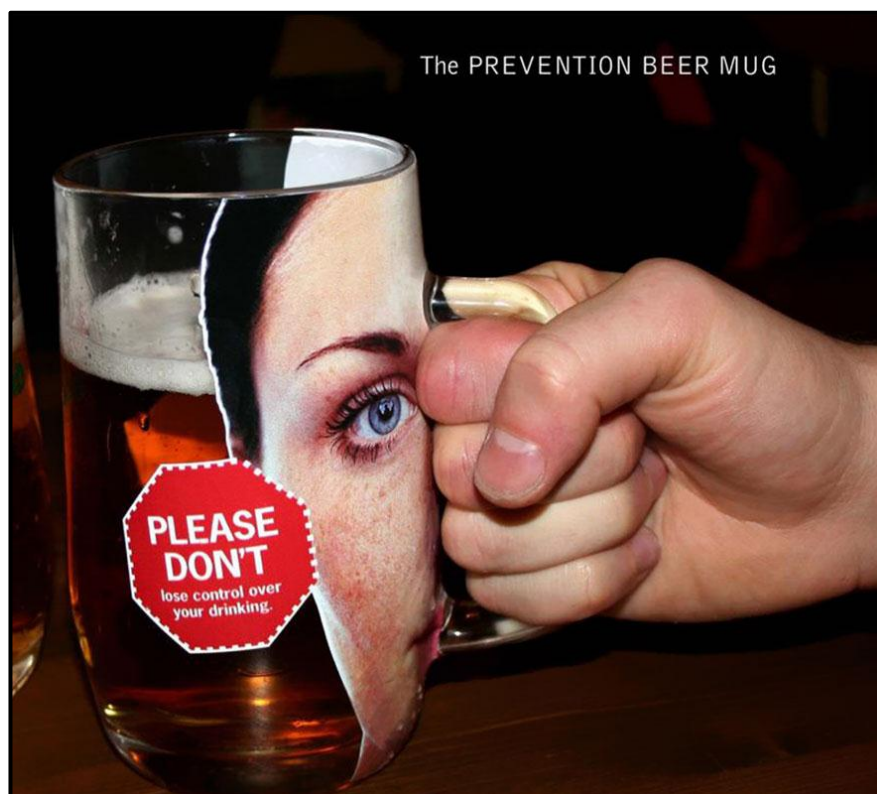
FIGURE J: Prevention Beer Mug Poster by EURORSCG Advertising Agency (Czech Republic), 2008.

5.1.1 Discuss how the message of the poster campaign in FIGURE J above is communicated by referring to the designer's use of layout and symbolism. (4)