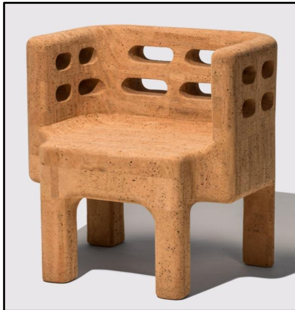
FIGURE L: Chair from the Sobreiro Collection by the Campana Brothers (Brazil), 2018. The chair is made of cork.

(Cork is a material that is derived from the bark of a cork oak tree. The bark is stripped from the tree, which is never cut down, to harvest the cork. Cork is environmentally friendly, waterproof and buoyant.)