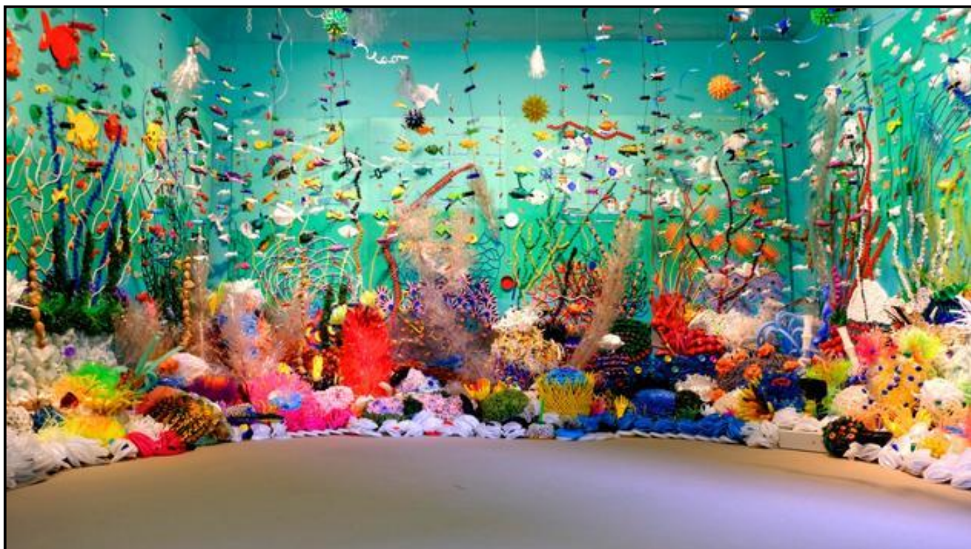
FIGURE 9: Federico Uribe's Personal Structures , 2019, was inspired by conservation and plastic pollution. Uribe has repurposed unusual objects and materials, such as bullet shells, coloured shoelaces, pins, pencils, electrical wires, ties and books to create a coral reef installation. From a distance the assemblages appear to be beautiful, colourful underwater worlds, reminding us of the fragility of life. Plastic production is unstoppable and according to the World Economic Forum, the world is now producing more than 300 million tons of plastic every year. Only 40 per cent is used once and more than 8 million tons of plastic are dumped into the ocean every year.