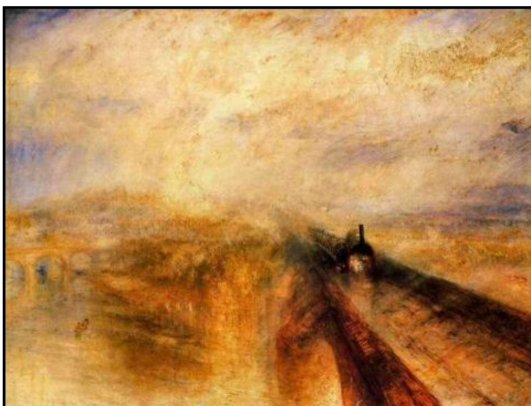
FIGURE 2: William Turner, Rain, Steam and Speed – The Great Western Railway , oil on canvas, 1844.

Over the centuries artists have been fascinated by depicting nature and landscapes.