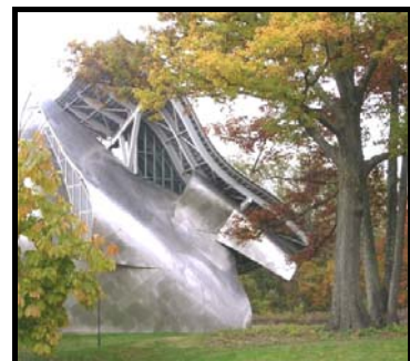
Fisher Performing Arts Centre