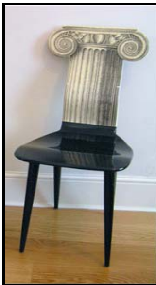
'Fornasetti or Ionic Capital' Chair by Piero Fornasetti

While Modernism rejected historical influences, the rebellious 1960s (Pop era) plundered the past for inspiration. ☑ The result is a ragbag of styles from everywhere. Fornasetti quoted/ borrowed from the Greek / Roman Classical culture ☑ and then gave the Ionic column – the capital - a twist to make it one of their signature/ 'timeless' designs. ☑ The classical ideals, such as beauty, harmony and intellect also appealed to the 'free-love hippy' culture of the Pop era. ☑ Typical of Pop design is the fact that this design is more youth-based and less serious when compared with the Good Design of the 1950s. ☑ The ironic humour visible in the strong load-bearing capital forms that have been transformed into furniture objects of fantasy – in which Surrealism had a role to play – is also a typical characteristic of many Pop designs. ☑ Black and white becomes a favourite colour scheme, influenced by Op Art and the work of Bridget Riley and this is also visible here. ☑ The chair also resembles the Victorian era and graphic prints found in books. ☑ This chair is similar to the 'Capitello' Chair of Studio 65. ☑