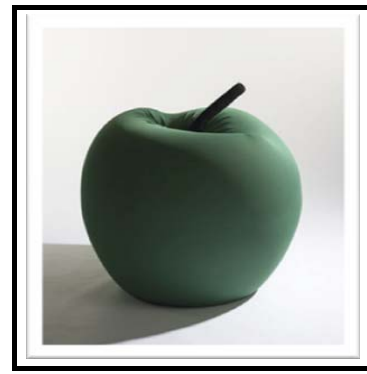
Green Apple Chair