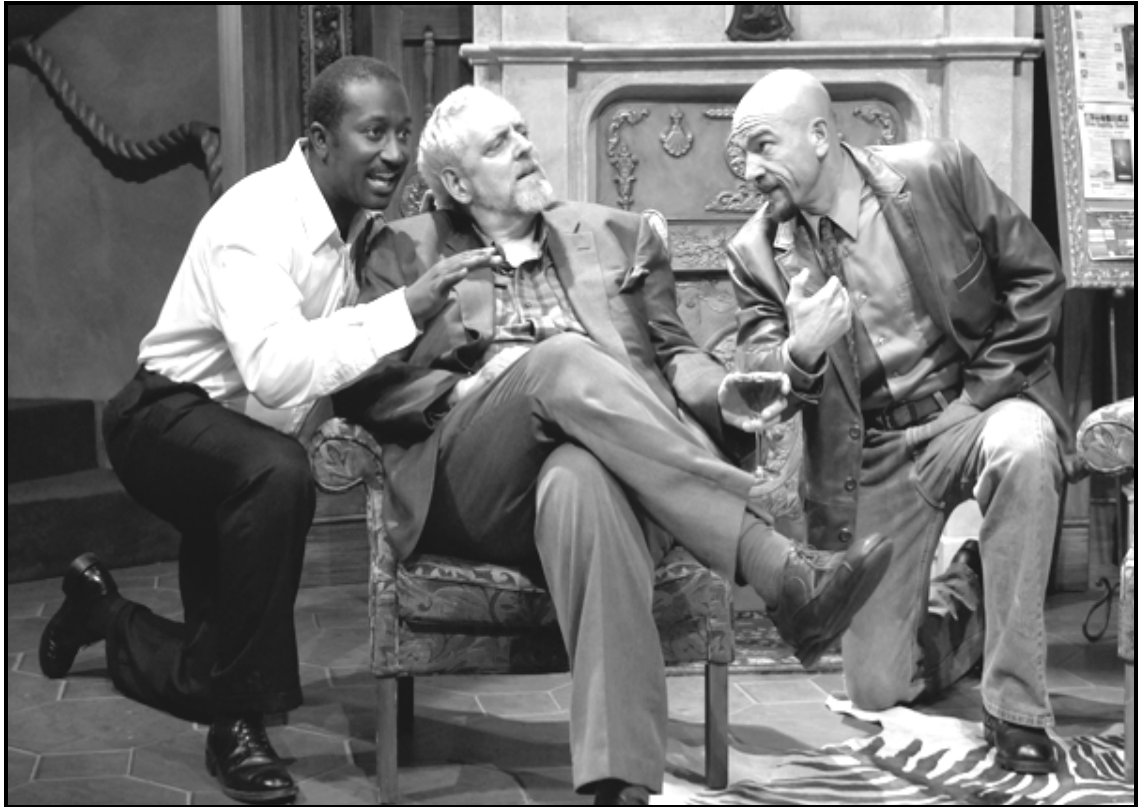
The characters Thami, Smith and Johan in Groundswell