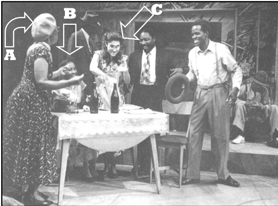
A production photo of Sophiatown showing the extract in SOURCE B

Refer to the sources below and answer the questions that follow.