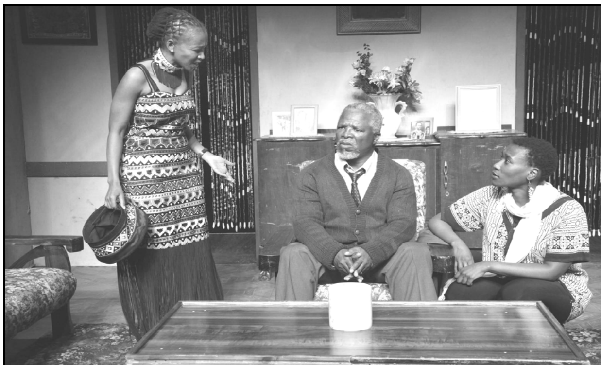
A production photo of Nothing but the Truth showing the extract in SOURCE B

Study the sources below and then answer the questions that follow.