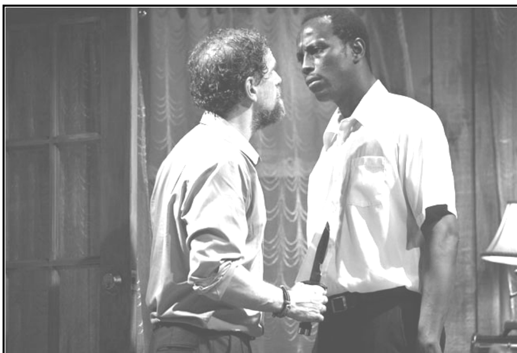
A production photo of Groundswell showing the extract in SOURCE A