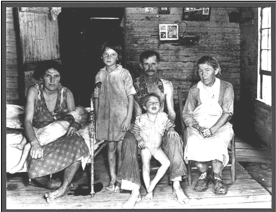
A photo taken during the Great Depression (1929–1933)

10.1 Study the sources and answer the questions that follow.