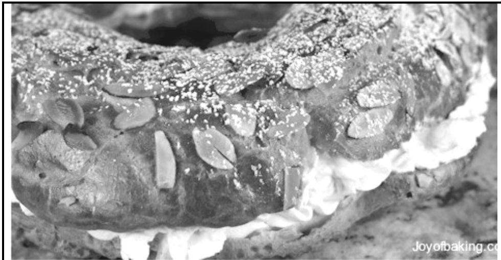
A. PARIS BREST

4.1 Study the photographs below and answer the questions that follow.