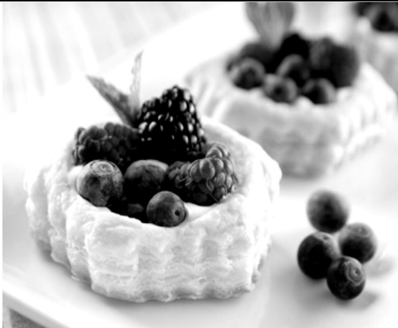
B. PASTRY CASE

4.1.1 Compare PASTRY A and PASTRY B under the following headings: