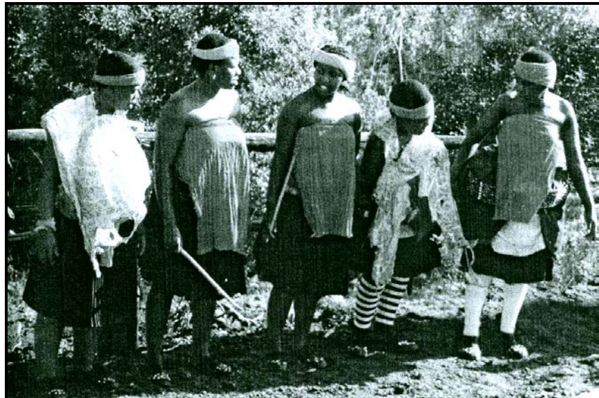
[Sicashunywe: Inkanyezi; 2004]