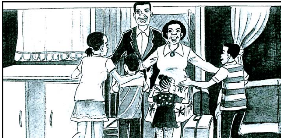
[Sicashunywe: Iphephabhuku LeSingisi 2013]