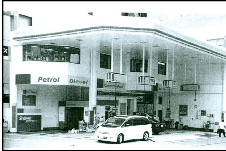
[Sicashunywe: Kwiphephabhuku Lesingisi 2013]