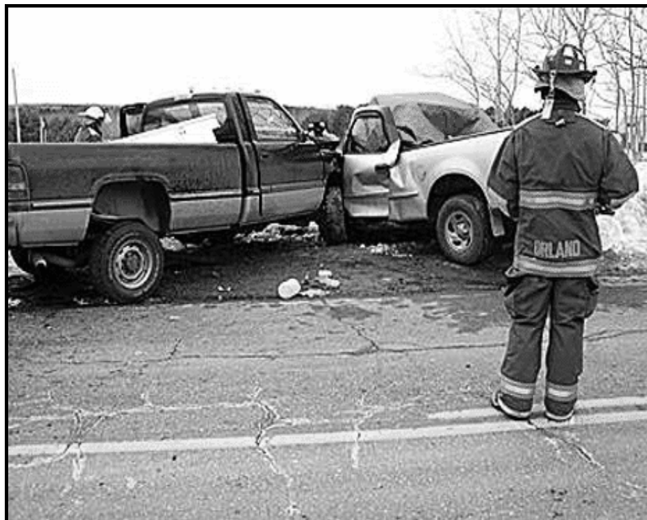
[ www.google.com ]