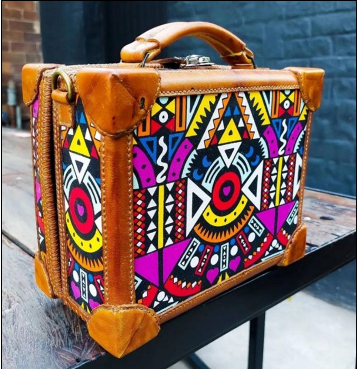
FIGURE B: The Mebala (meaning 'colours' in Setswana), a handcrafted customised leather bag by #DI Emerging Creative, Tlhalefang Moeletsi (South Africa), 2020.

Analyse the use of the following elements and principles in FIGURE B above: