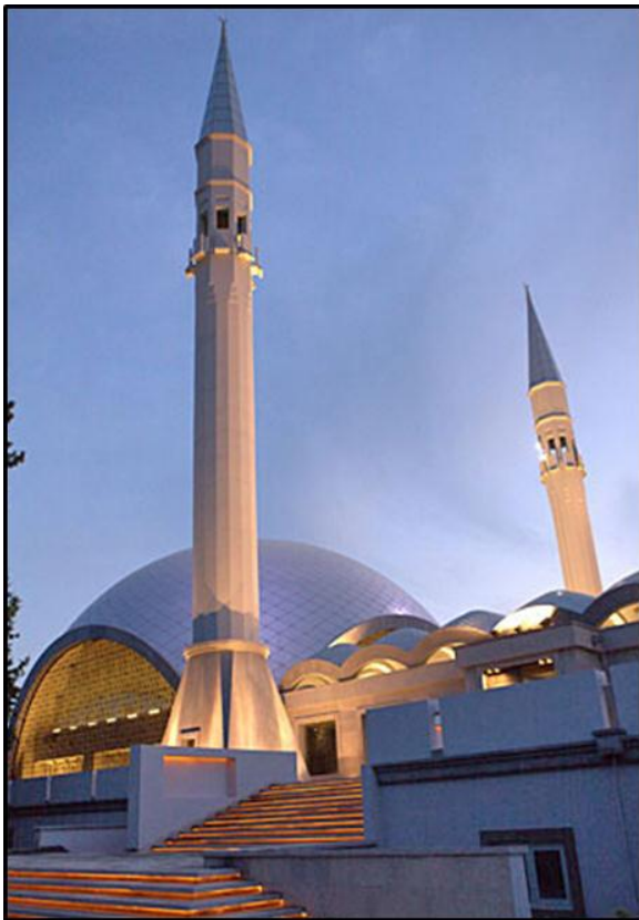
FIGURE G: Şakirin Mosque by Zeynep Fadillioglu and Hüsrev Tayla, (Turkey), 2009.