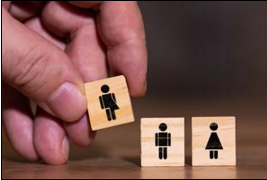
FIGURE J: Advertising Campaign by Council of Europe, designer unknown (Europe), 2020.