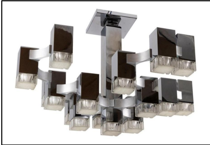
FIGURE H: Modernist chandelier by Gaetano Sciolari (Italy), 1970s.