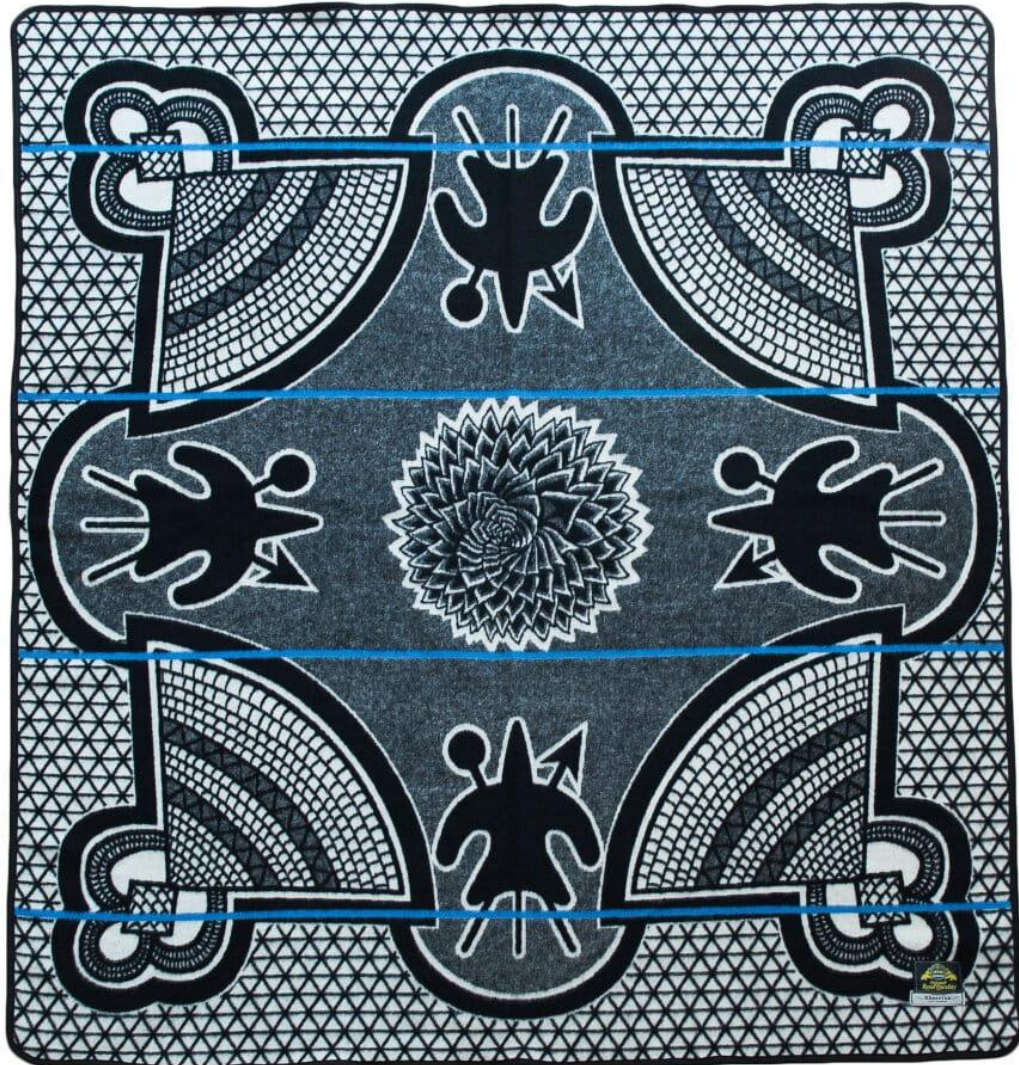
FIGURE A: Kharetso Aloe Heritage Basotho blanket , designer unknown (Lesotho), date unknown.

Analyse the use of the following elements and principles in FIGURE A above: