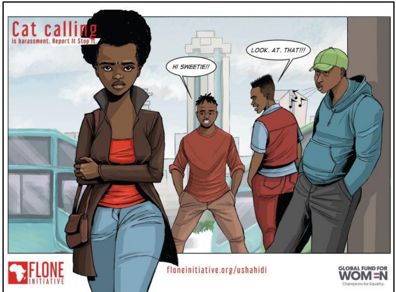
FIGURE C: 'Cat calling' poster by Flone Initiative (Kenya), 2019.