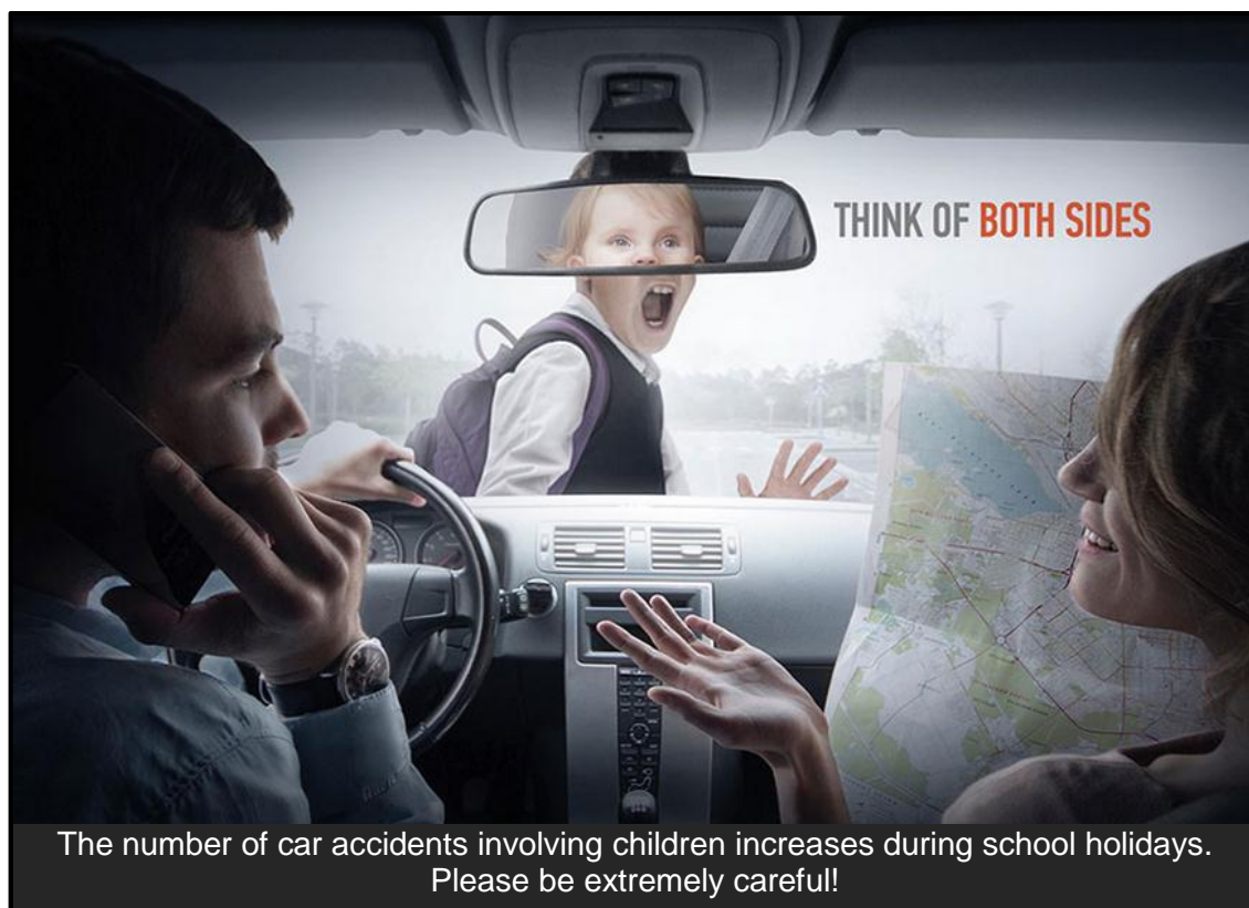
FIGURE K: Distracted Driving: Think of Both Sides by Red Pepper Agency (Russia), 2013.