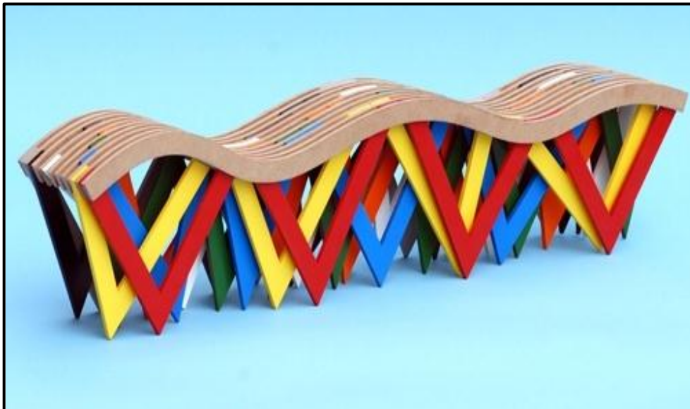
FIGURE E: University bench by Frederick Kim (USA), 2010.

Compare the bench in FIGURE D with the bench in FIGURE E.