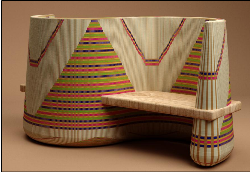
FIGURE D: Sangu bench by Katlego Tshuma (South Africa), 2020.