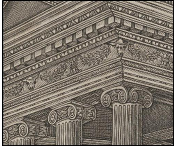
Detail of the frieze of the Roman Temple of Portunus .