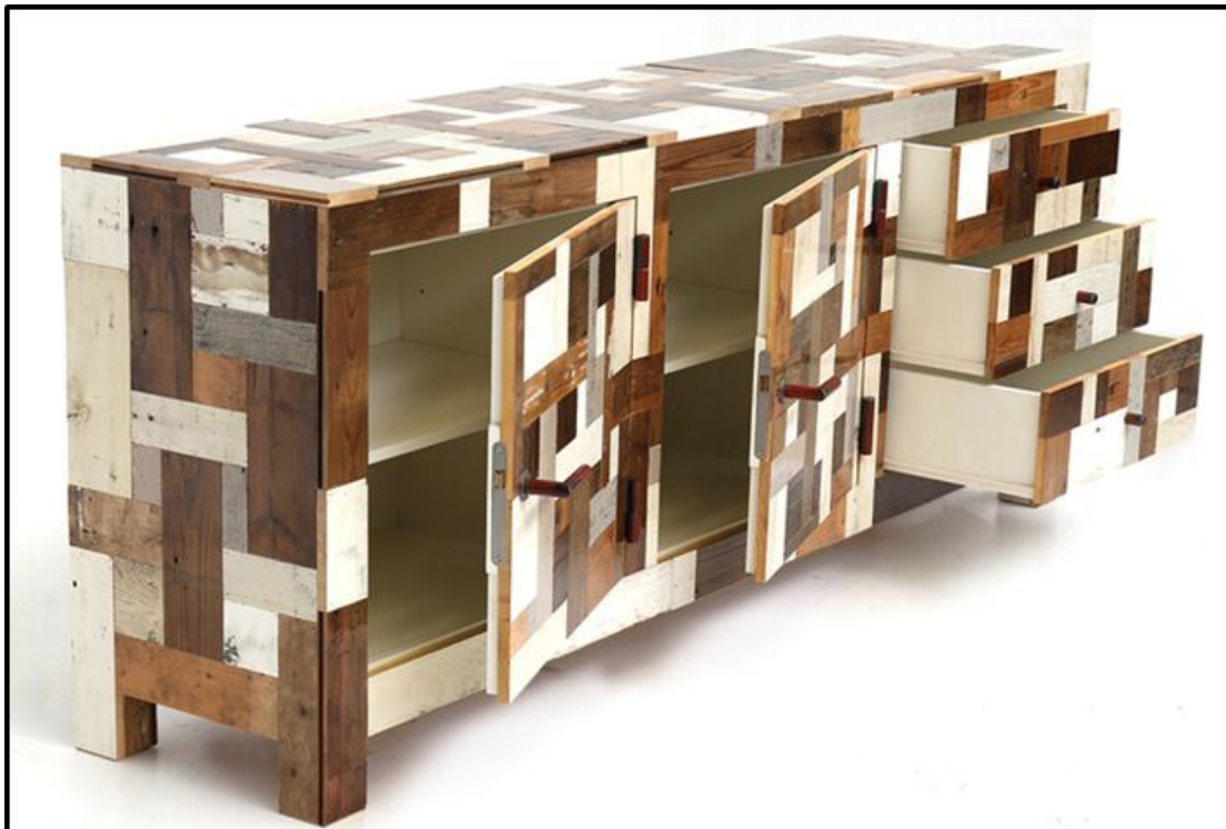
FIGURE M: Waste Cabinet made using scrap wood by Piet Hein Eek (Netherlands), 2017.

6.1.1 Explain the environmental benefits of using scrap materials when creating unique design products by referring to FIGURE M above. (2)