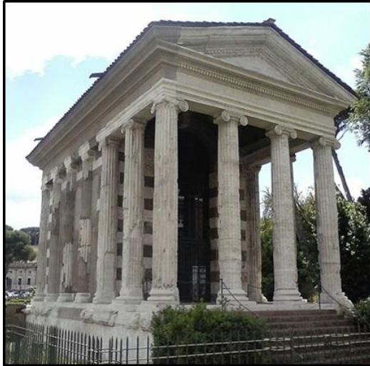
FIGURE F: Roman Temple of Portunus (Italy), 1 st century before the common era (BCE).

Answer QUESTION 3.1 OR QUESTION 3.2 OR QUESTION 3.3.