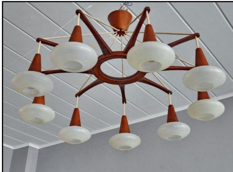
FIGURE I: Scandinavian Sputnik Chandelier , designer unknown, (country unknown), 1950s.

Write an essay (at least ONE page) in which you compare the chandelier in FIGURE H with the chandelier in FIGURE I. Explain how the chandeliers are typical of the design movements they represent.