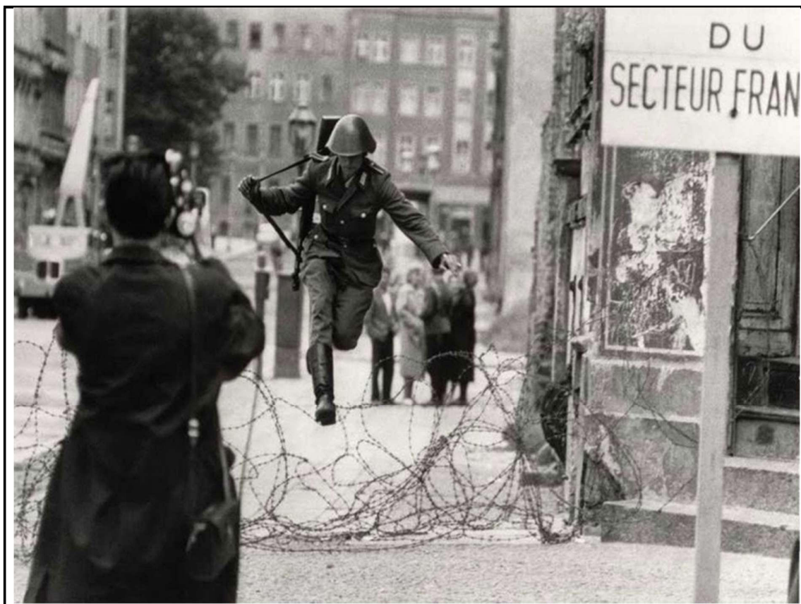
[From Bild , 16 August 1961]

The photograph below was taken by Peter Leibing, a nineteen-year old West German photographer on 15 August 1961. It was published on the front page of the German newspaper Bild on 16 August 1961. It depicts the East German border policeman Conrad Schumann jumping the barbed wire barricade between East and West Berlin.