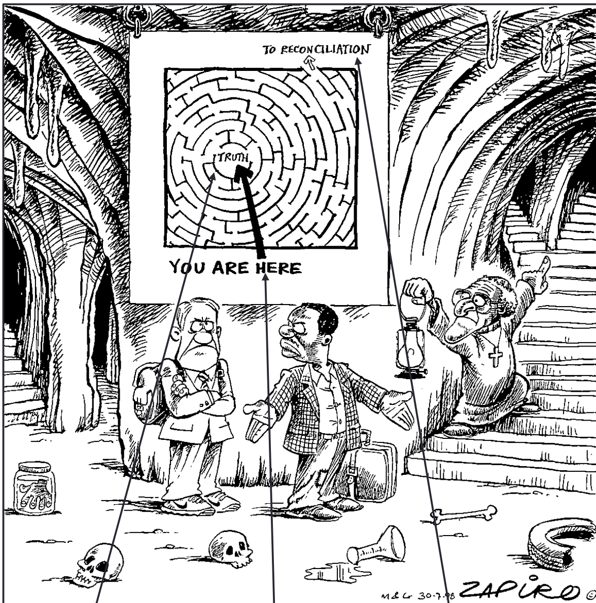
[Ho tswa Zapiro, End of Part One by J. Shapiro.]

Ena ke khathuni ka Zapiro a tshwaela ka katleho ya Truth and Reconciliation Commission (TRC) Phupu 1998.