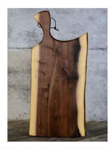
TABLE 5: INCOME AND EXPENSES OF MORNE'S CHARCUTERIE BOARDS BUSINESS