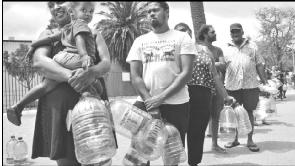
[Lo mfanekiso uthathwe kwi- www.un.org/africarenewal/magazine/april-2018 ]